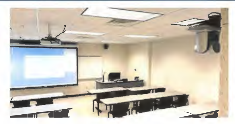
Note: The technology in the classroom is designed to work Webex as you would with a laptop except the camera is mounted on the wall and the microphone is attached to your clothing.