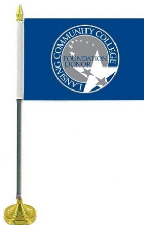
Limited Edition Desk Flag

For a limited time donors to the Foundation who establish a new, or increase an existing, recurring donation either through payroll deduction or credit card, will receive an attractive limited edition LCC desk flag that identifies them as Foundation donors.