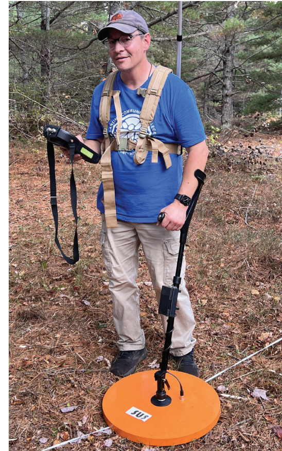
LCC student using a Magnetic Susceptibility Meter