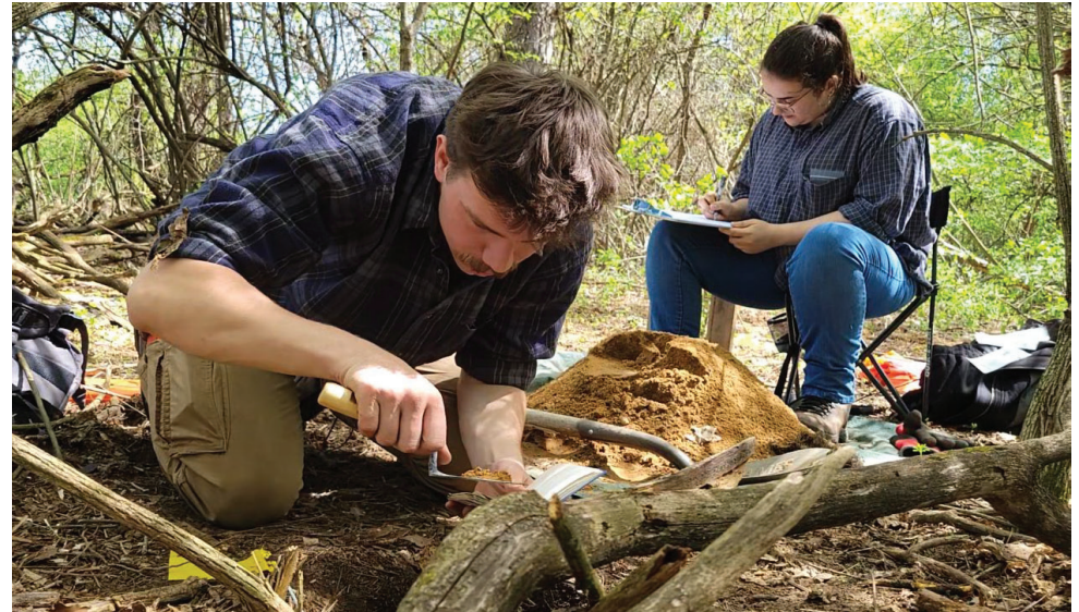
LCC students at the Rose Lake archaeology site