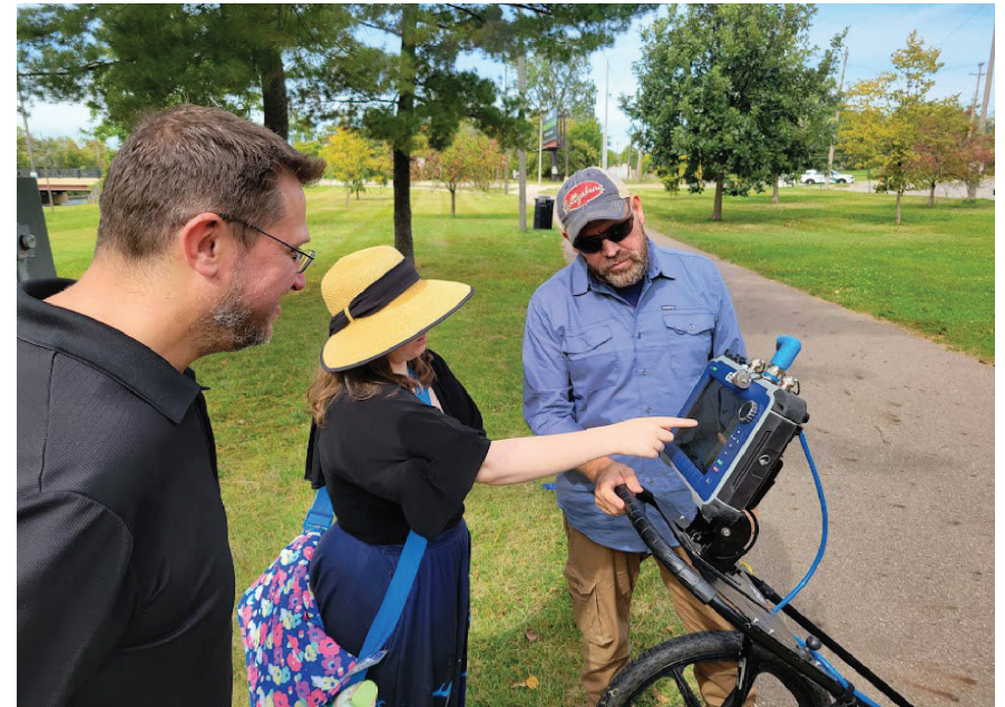
LCC students learn to use Ground Penetrating Radar